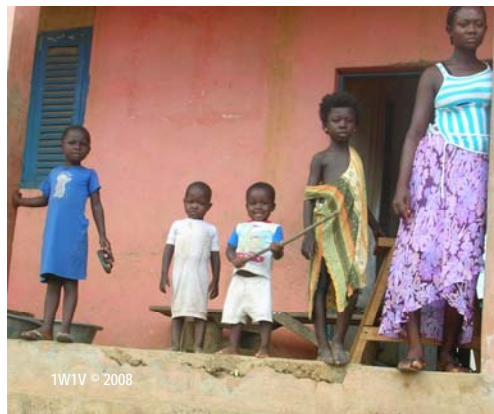
12 year old girl above is not in school. She watches younger siblings while mother sells snails for income for the family.