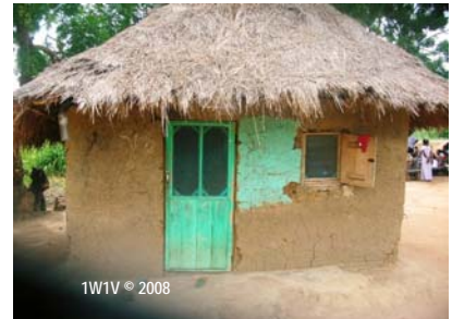
Village Home made from mud, has one room and normally houses a family of 6-10 people.