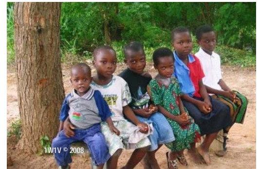
Children 5 to 11 years old currently not in school waiting for sponsorship

1World1Vision [AICPC] P.O. Box 18232 Atlanta, GA 30316-0232