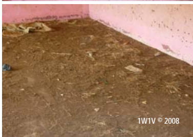
1W1V © 2008

Bats living in the attic space and mold are slowly destroying the ceiling and interior walls. The floor is covered with bat droppings, dirt and debris.