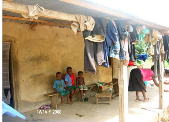
Children of Apessa Village have visions of becoming doctors and lawyer but rarely have the opportunity to attend school.

We are on the web! www.1world1vision.com