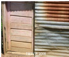
The clinic building at Mim out house urinal is rusting away.

"The nearest hospital is 30 miles away. Anyone who becomes ill must travel by taxi (if available) as ambulances are not the norm in Ghana."