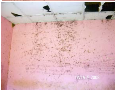
1W1V © 2008