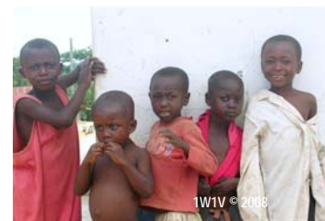
Children outside the Mim Clinic

"Healing begins with a helping hand. Together we can give hope, love, and a chance for a happy productive life that these beautiful people deserve. Won't you join us?"