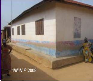
The clinic building at Mim. Exterior view belies the needed repairs on the interior

"The nearest hospital is 30 miles away. Anyone who becomes ill must travel by taxi (if available) as ambulances are not the norm in Ghana."